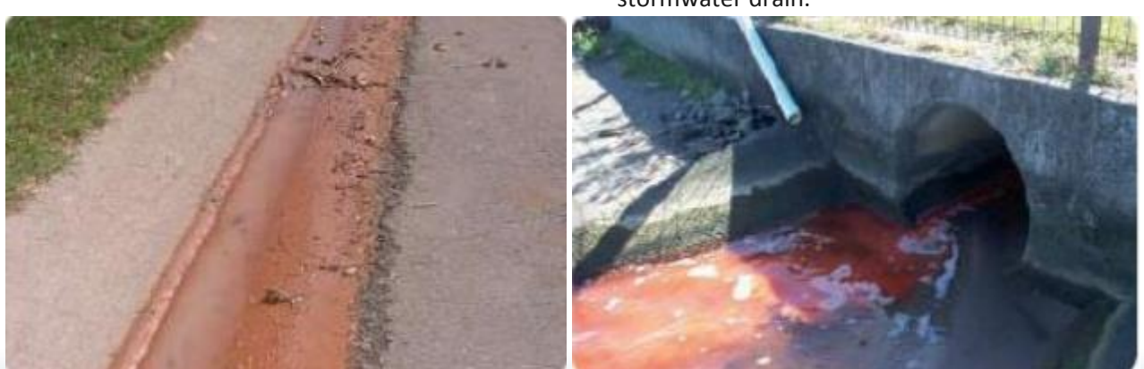
Wastewater residues left in a roadside gutter

Always keep handy a spill response kit, including a shovel, broom and rags, to clean-up residues. Do not wash or hose remaining waste materials down the stormwater drain.