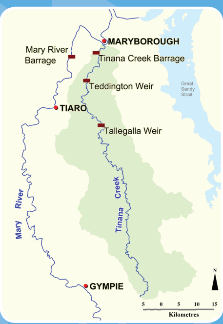
Tinana Creek Catchment