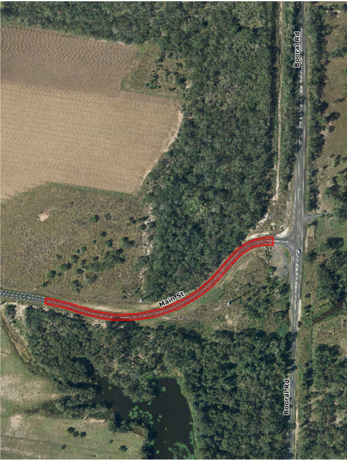
Asphalt Resurfacing—Part of Main Street, Nikenbah