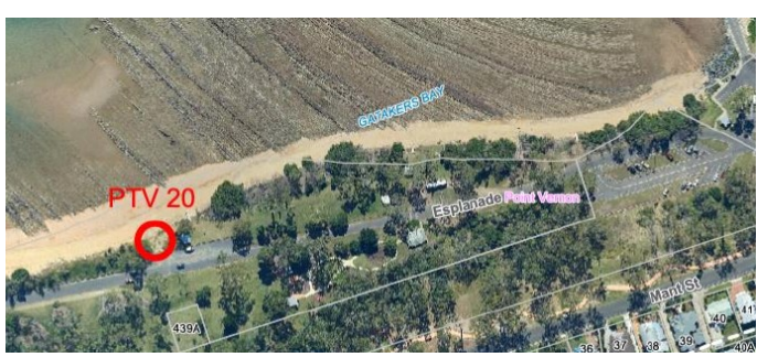
See larger layout plans attached for more detail (Page 2)