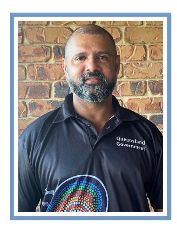
Artist: Conway Burns

The piece demonstrates the relationships formed between stakeholders involved in developing the Strategy, guided by the first Butchulla Lore 'What is good for the land must come first'.