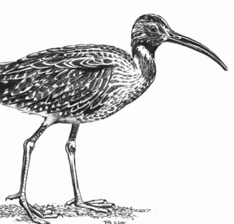
Whimbrel (Numenius phaeopus)

Shorebirds change their body feathers at least twice a vear. Once when they attain a colourful breeding plumage, and then again when they attain a plain winter plumage.