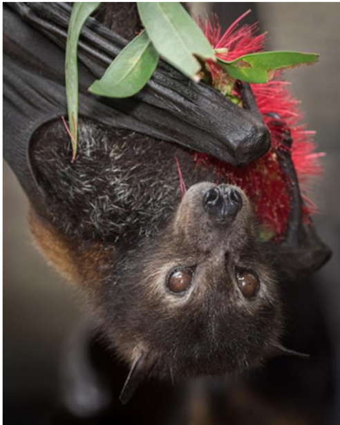
Black flying foxes.

Black flying fox peak conception time occurs in March and April, with pups generally born between September and December. Pups will be carried for four weeks before they are left at a roost in a 'creche' while mothers forage at night. At two to three months of age, young will begin to leave the roost to forage.