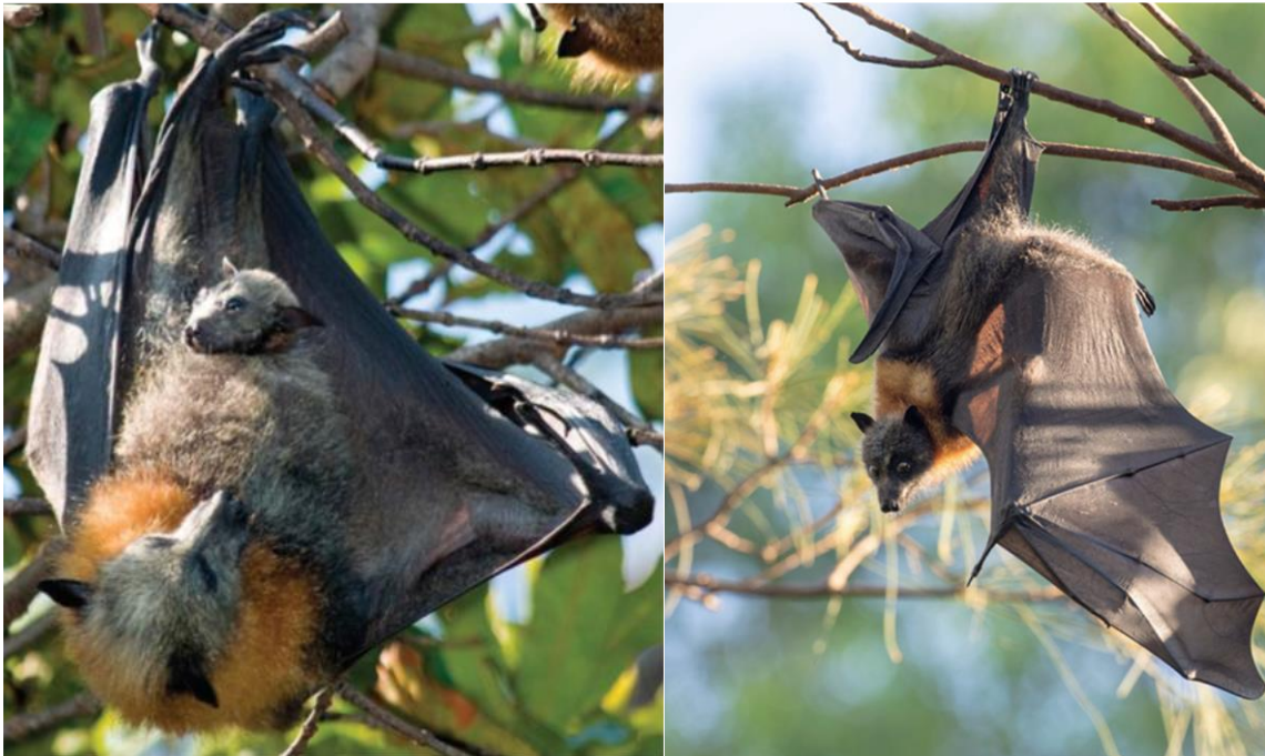
Grey-headed flying fox.

This flying fox is generally found within 200 km of the coast, with Rockhampton representing the northern extent of this species' distribution. This animal forages and roosts in rainforests, open forests or closed and open woodlands, often within urban or peri-urban areas. Peak conception occurs between March and April and birthing generally occurs between September and October.