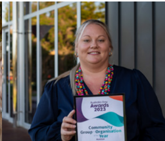
Community Group or Organisation of the Year Recipient - Hervey Bay Neighbourhood Centre