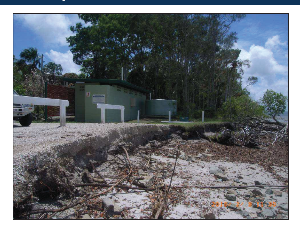
Plate 5: Erosion - Poona (approx. 1.0m high)