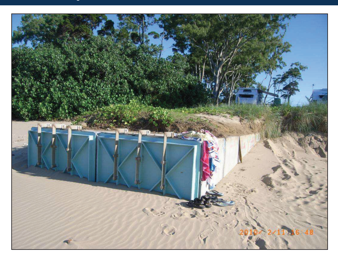
Plate 4: Stormwater Outlet: Scarness

Storm tide inundation is discussed in Section 5.3.6.