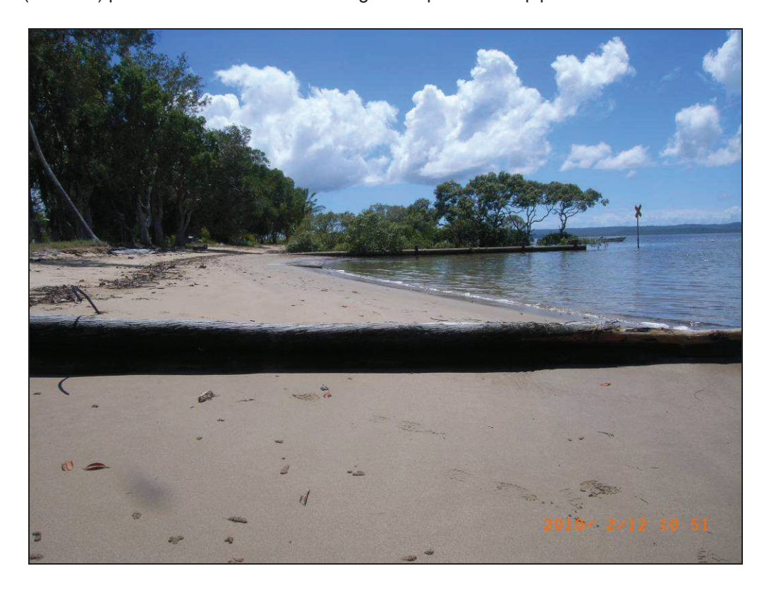
Plate 3: Stormwater Outlet: Poona

Porter (undated) provides advice on best management practice for piped beach outfalls.