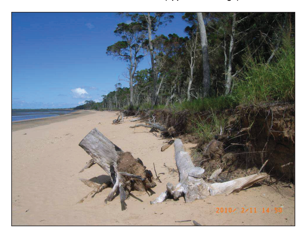
Plate 6: Erosion – Dundowran (approx. 1.4m high)

Sources of additional information on locations affected by, or vulnerable to, erosion include: