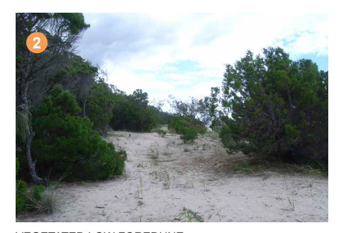
VEGETATED LOW FOREDUNE