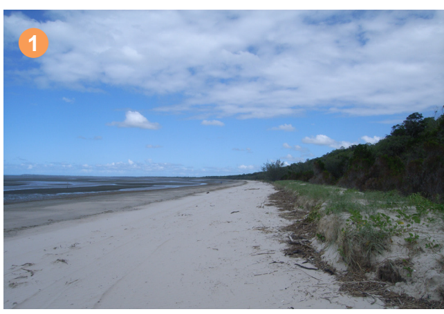
LOW PROFILE BEACH